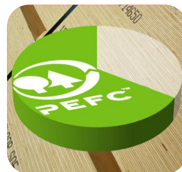
1/3 of all certified timber on the Dutch market is from PEFC certified forests